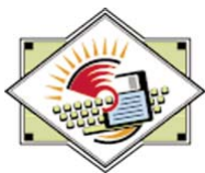
Business, Management, Marketing & Technology